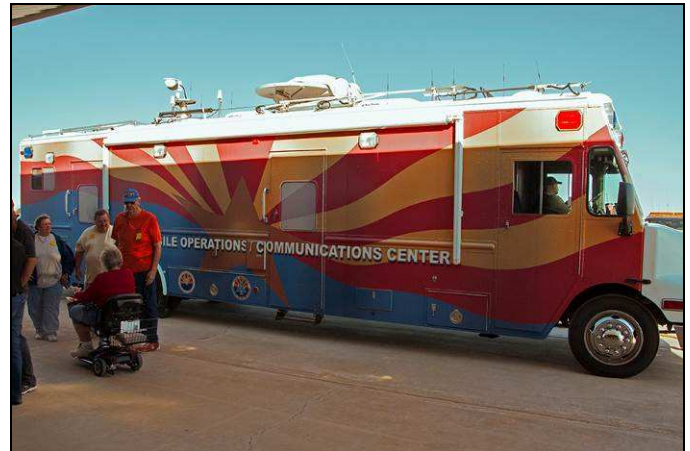
State Mobil Communications Operations Center